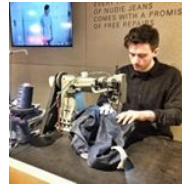
( https://www.instagram.com/positiveluxury/ )