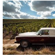
( https://www.instagram.com/positiveluxury/ )