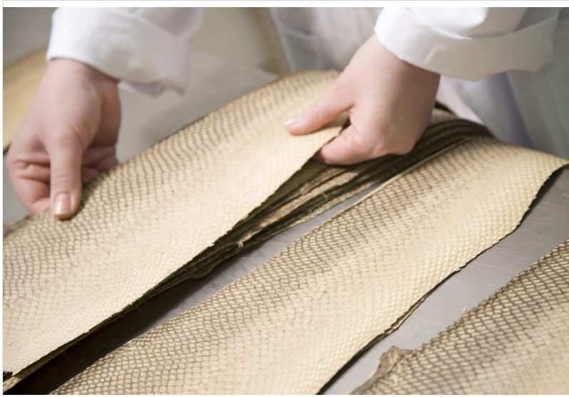
Fish Leather by Nanai Tannery

Fish skin may seem delicate, but it has been re-worked into a soft yet durable leather for hundreds of years. Traditionally used for boats, tents, wallets and clothing by natives to Iceland and Scandinavia, fish leather has recently seen a resurgence as designers seek out sustainable material alternatives.