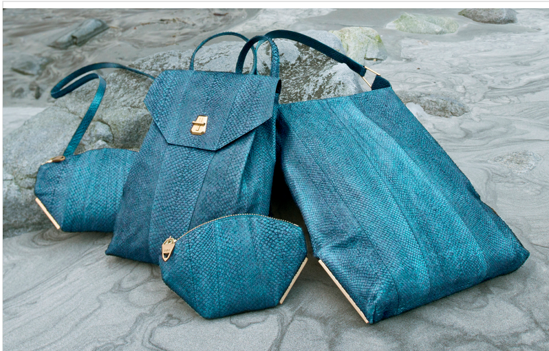
( https://www.positiveluxury.com/brand/aitch-aitch/ )

Salmon is the most commonly used skin, making use of a by-product from the fishing industry that would otherwise be wasted. Nanai ( http://www.salmo-leather.de/ ) is one such tannery that is championing fish leather. It sources its skins from certified organic salmon farms in Ireland and uses non-toxic, non-chemical tanning and dyeing techniques to transform them into a durable yet fashionable material.