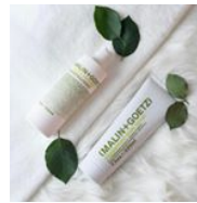
( https://www.instagram.com/positiveluxury/ )